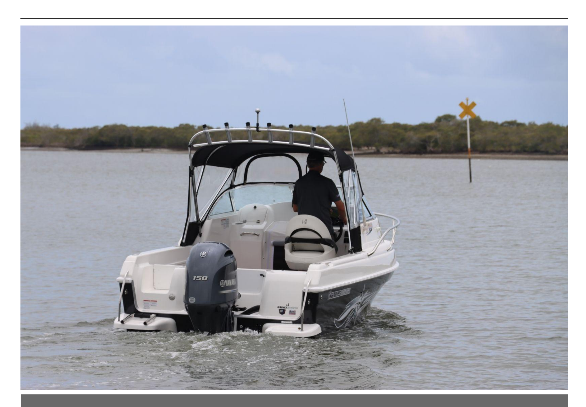
Haines Hunter 565 Offshore + Yamaha F150hp 4-Stroke - Pack 2 for sale online prices $98,990