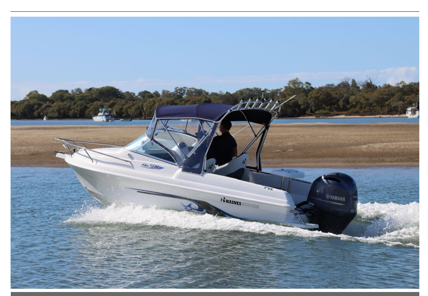
Haines Hunter 580 Sport Fish + Yamaha F130hp 4-Stroke - Pack 1 for sale online prices $78,780