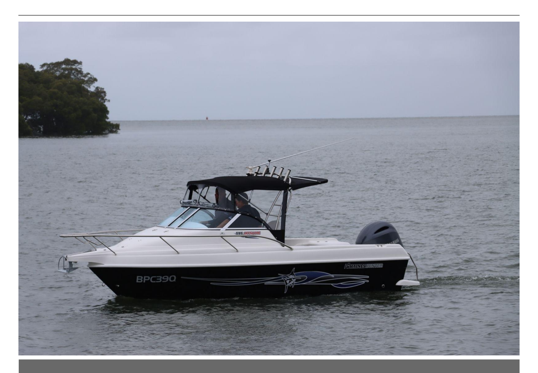
Haines Hunter 595 Offshore + Yamaha F175hp 4-Stroke - Pack 2 for sale online prices $118,790