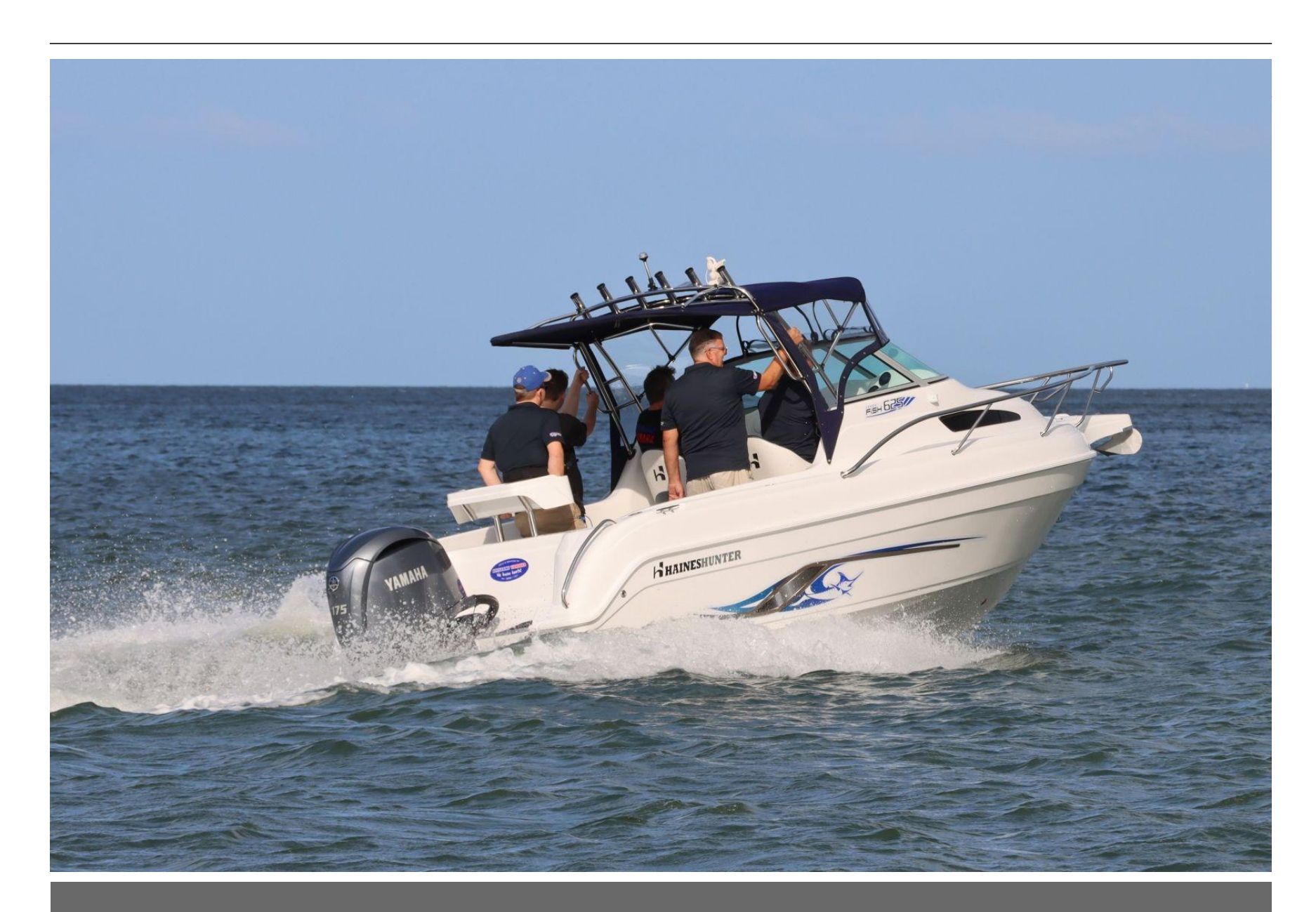
Haines Hunter 625 Sport Fish + Yamaha F175hp 4-Stroke - Pack 2 for sale online prices $131,990