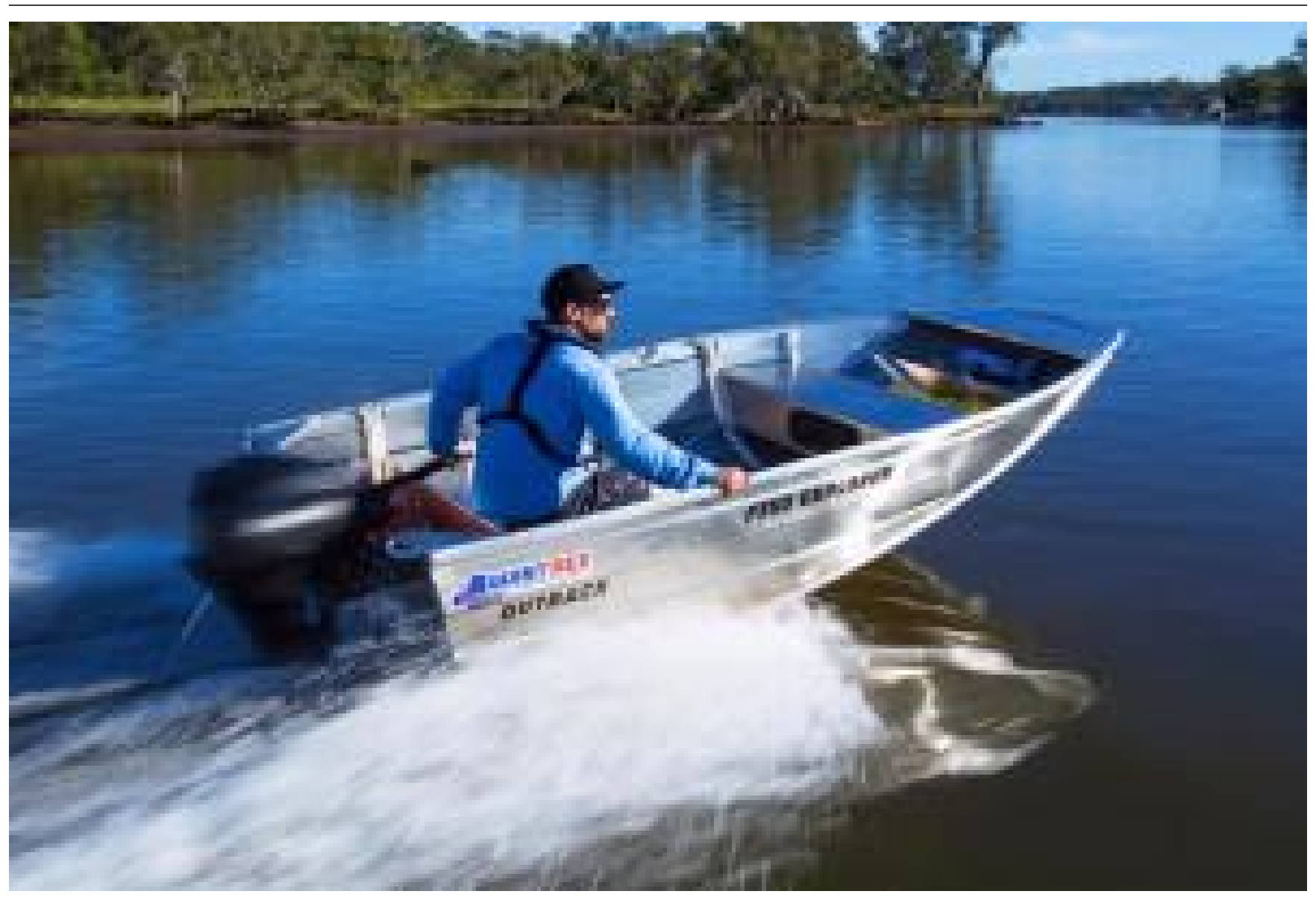
Quintrex 430 Fishabout + Yamaha F60hp 4-Stroke - Pack 3 for sale online prices

Email: online@brisbaneyamaha.com.au Website: www.brisbaneboatsforsale.com.au