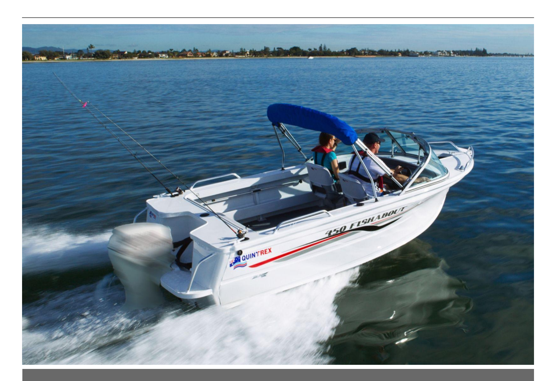
Quintrex 450 Fishabout + Yamaha F60hp 4-Stroke - Pack 1 for sale online prices $38,290