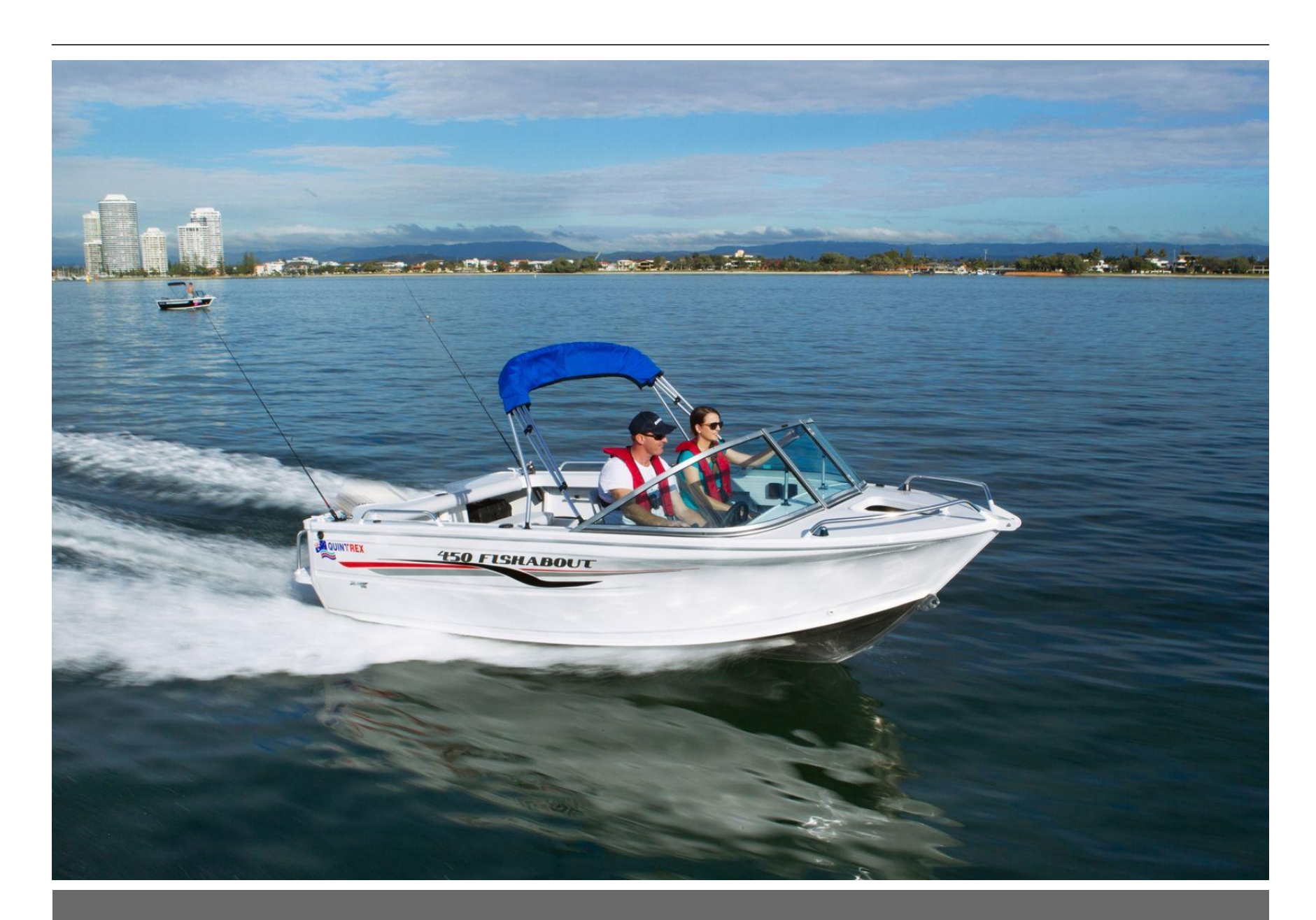
Quintrex 450 Fishabout + Yamaha F60hp 4-Stroke - Pack 2 for sale online prices