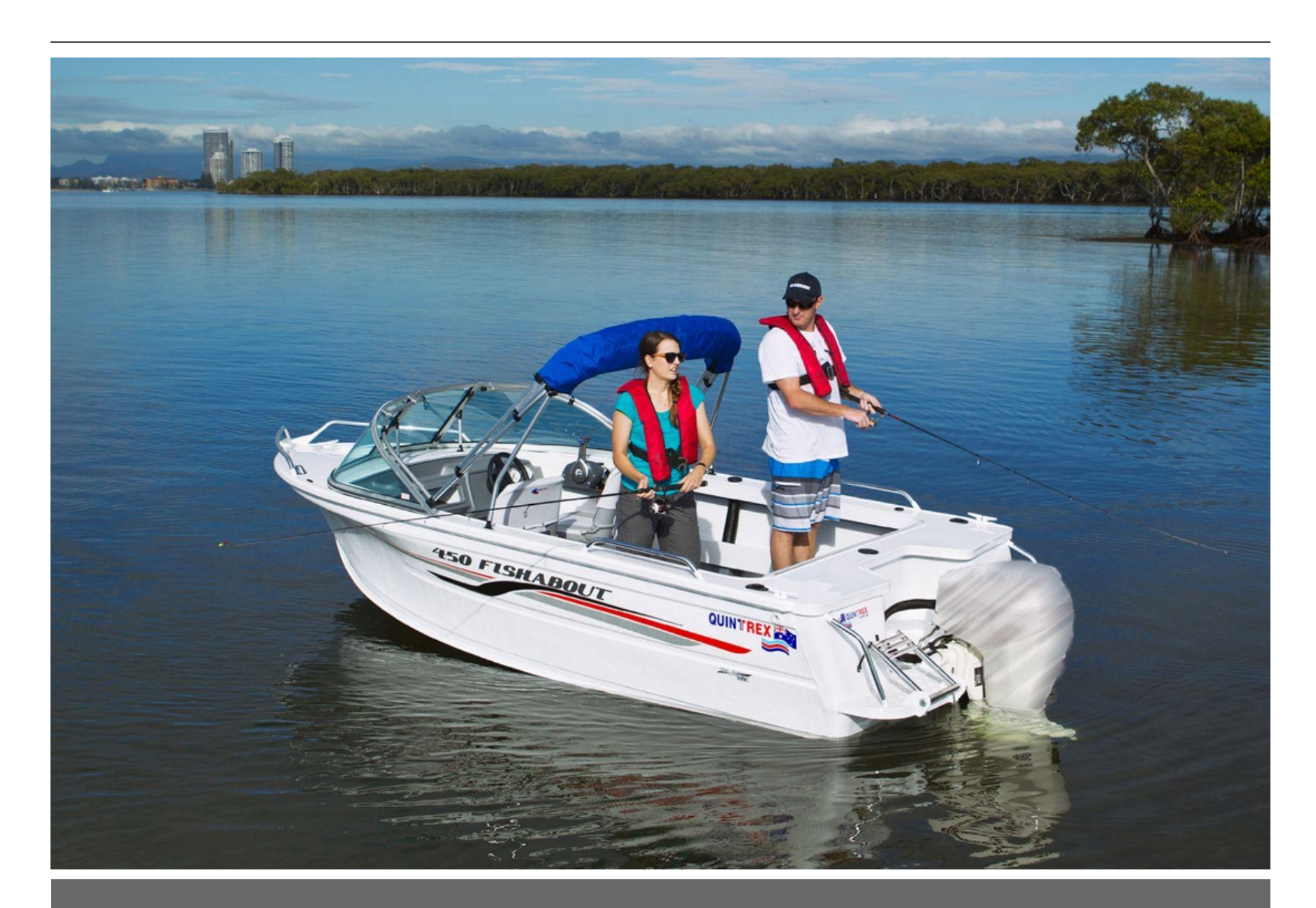
Quintrex 450 Fishabout + Yamaha F75hp 4-Stroke - Pack 4 for sale online prices $52,790