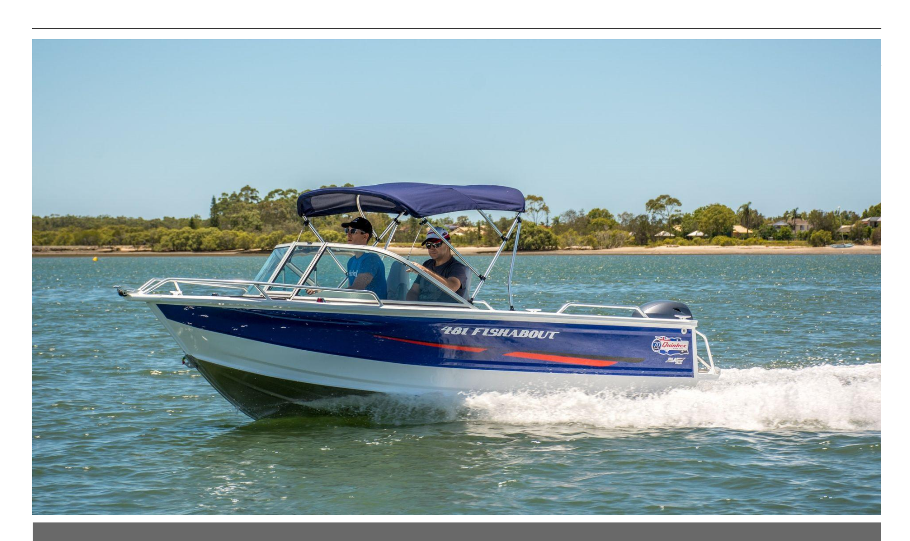
Quintrex 481 Fishabout + Yamaha F70hp 4-Stroke - Pack 1 for sale online prices $43,790