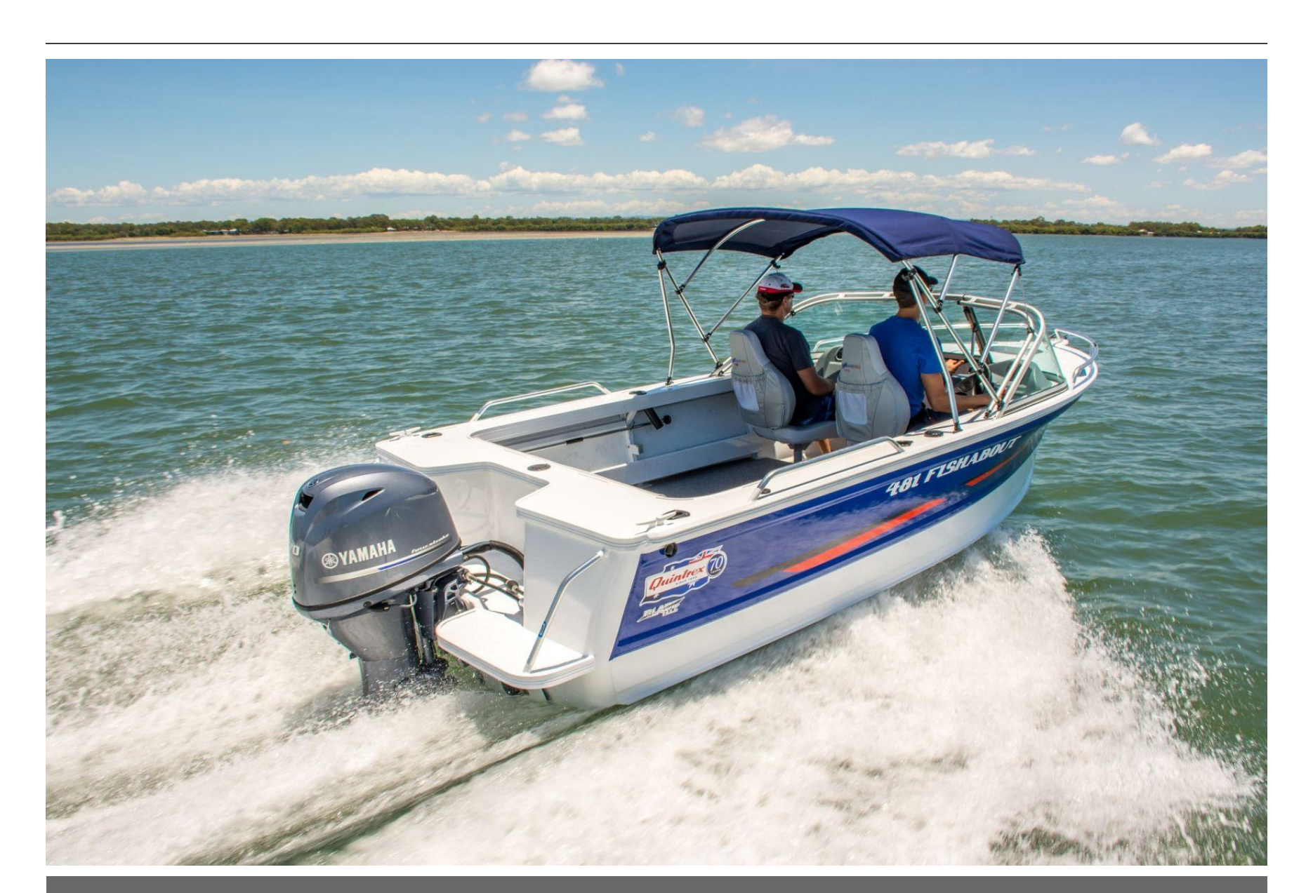
Quintrex 481 Fishabout + Yamaha F70hp 4-Stroke - Pack 2 for sale online prices $46,390