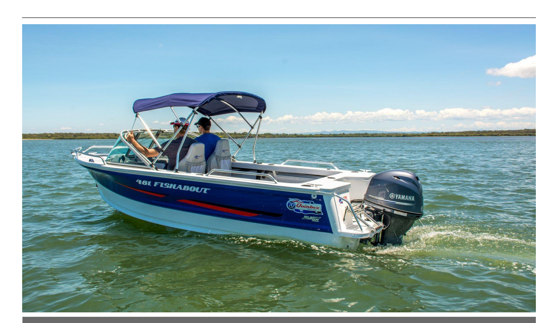
Quintrex 481 Fishabout + Yamaha F75hp 4-Stroke - Pack 3 for sale online prices