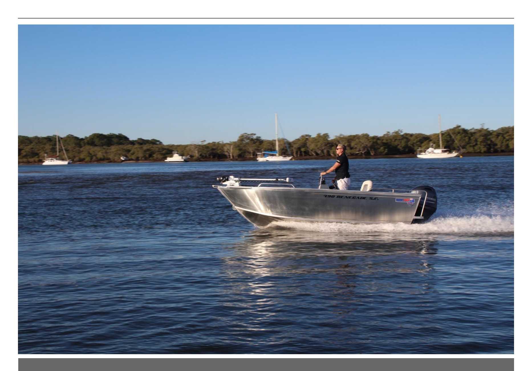
Quintrex 490 Renegade SC(Side Console) + Yamaha F70hp 4-Stroke - Pack 1 for sale online prices