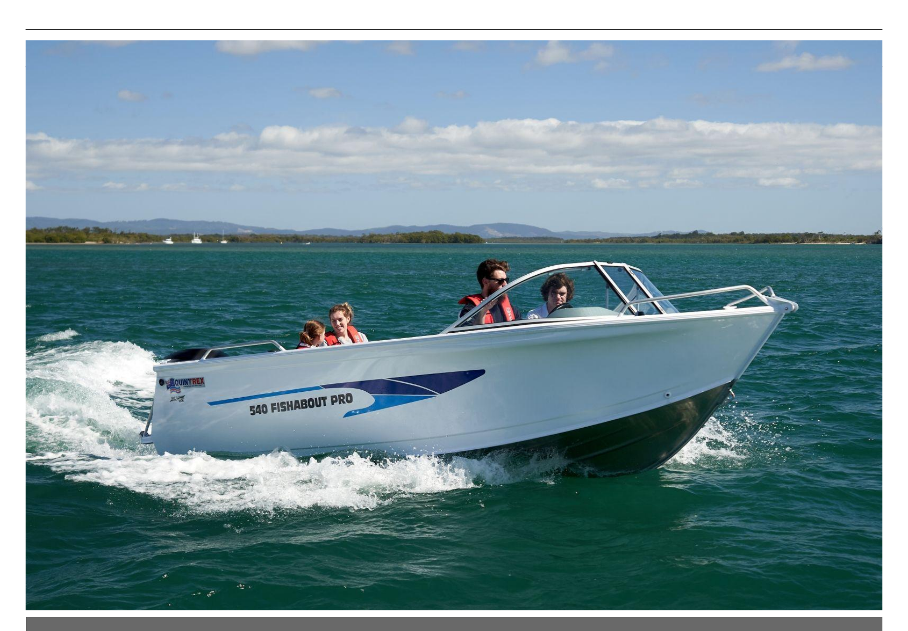
Quintrex 540 Fishabout + Yamaha F130HP 4-Stroke - PRO Pack for sale online prices $73,990

Website: www.brisbaneboatsforsale.com.au