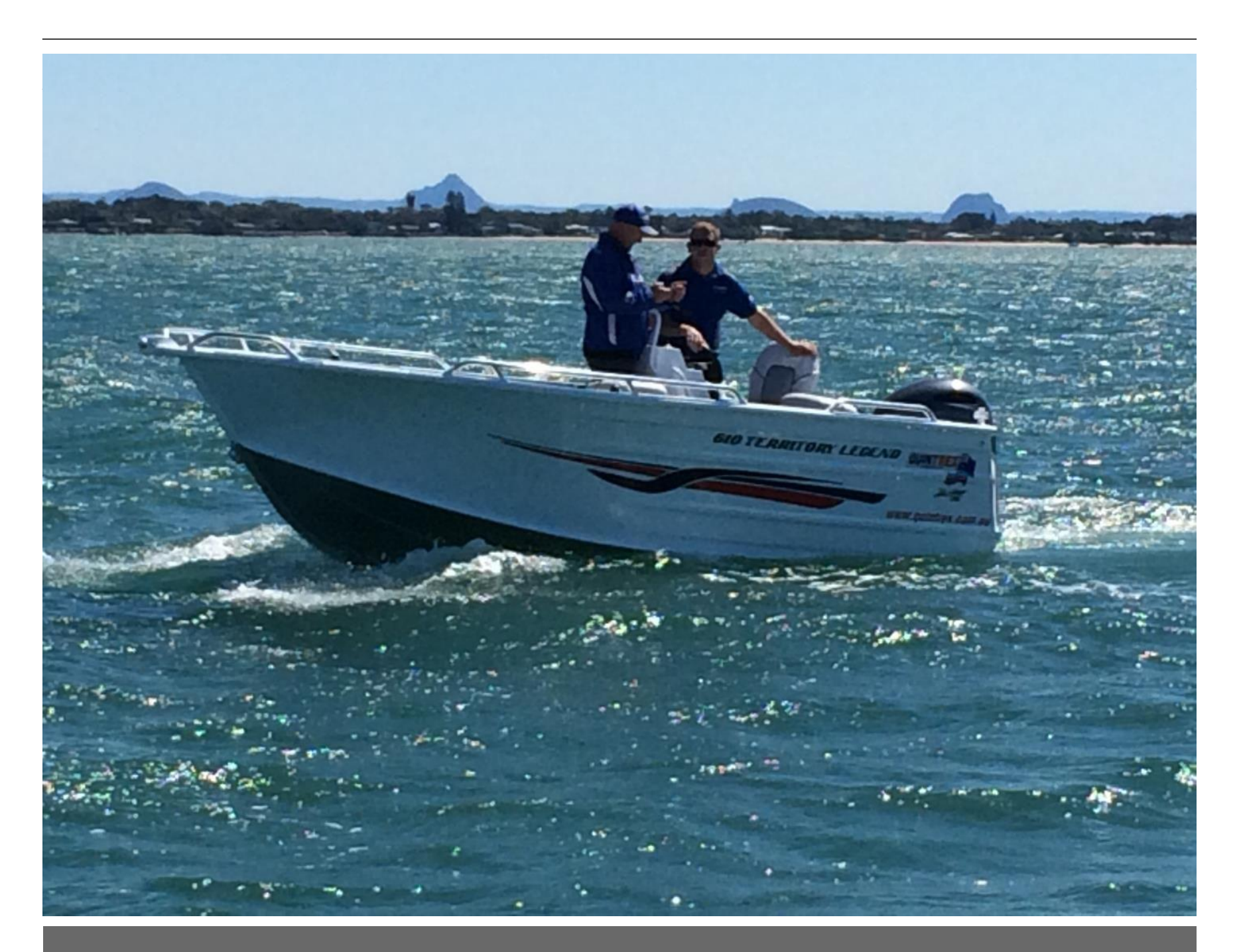
Quintrex 610 Territroy Legend + Yamaha F150HP 4-Stroke - Pack 1 for sale online prices