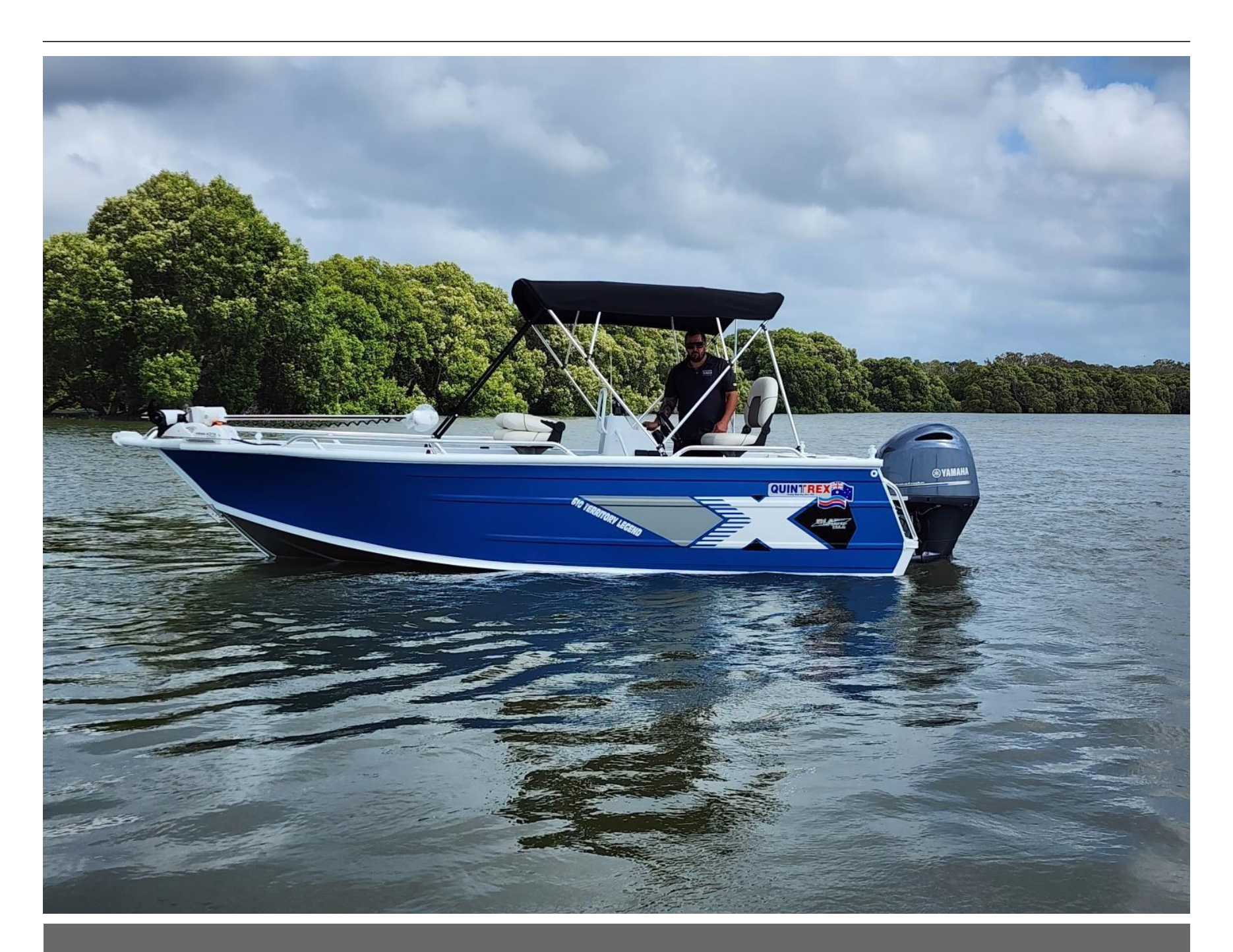
Quintrex 610 Territroy Legend + Yamaha F150HP 4-Stroke - Pack 2 for sale online prices $89,990