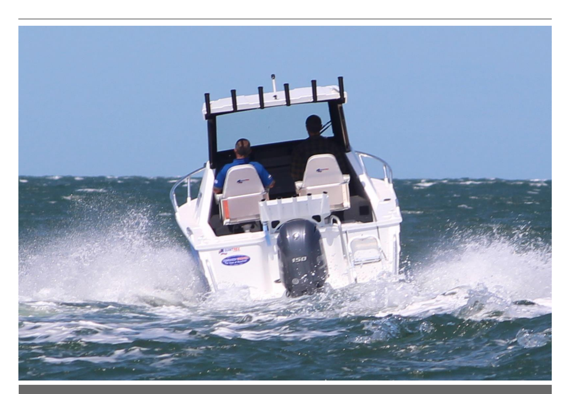
Quintrex 610 Trident Hard Top + Yamaha F150hp 4-Stroke - Pack 1 for sale online prices $106,790