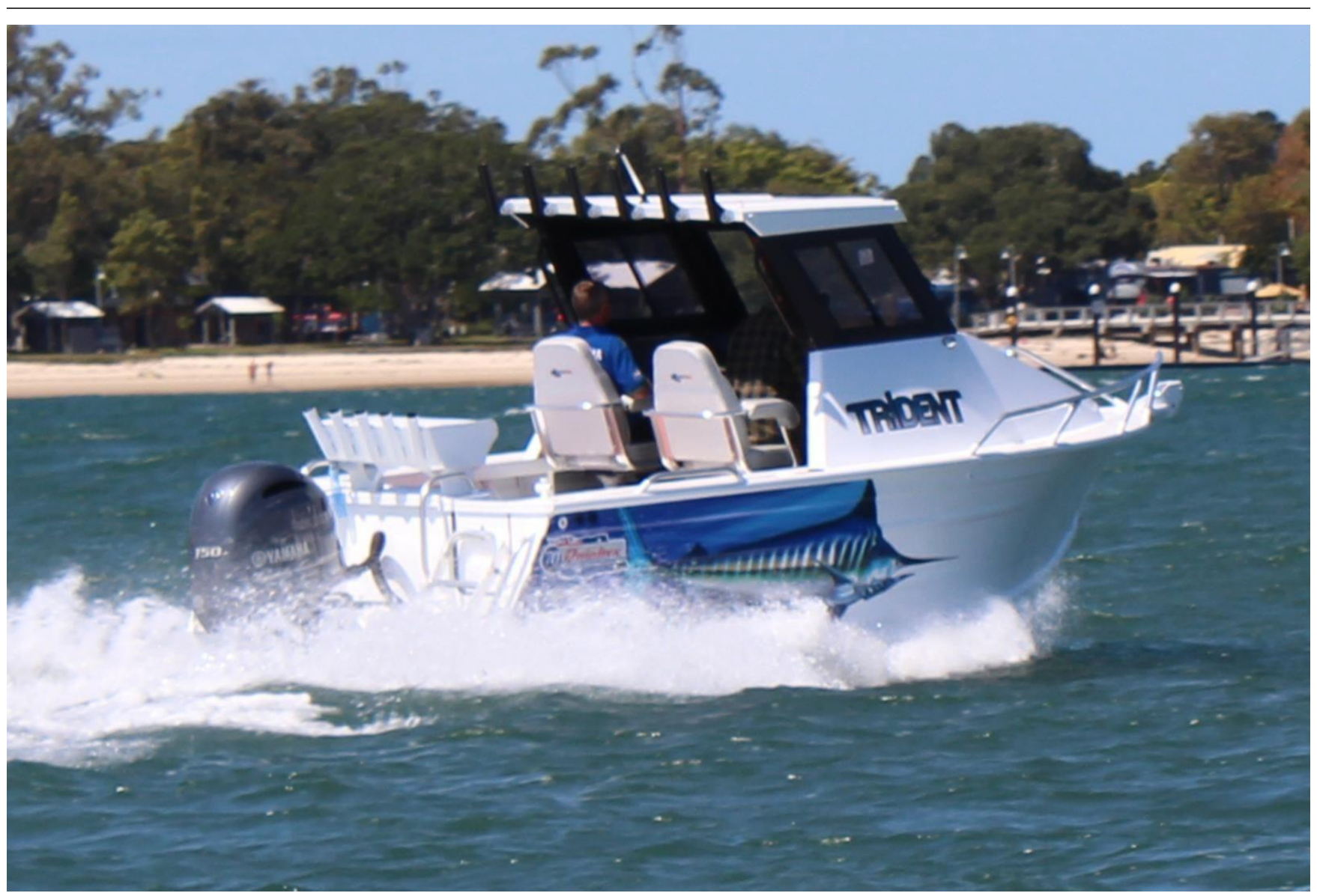
Quintrex 610 Trident Hard Top + Yamaha F150hp 4-Stroke - Pack 2 for sale online prices $111,890

Website: www.brisbaneboatsforsale.com.au