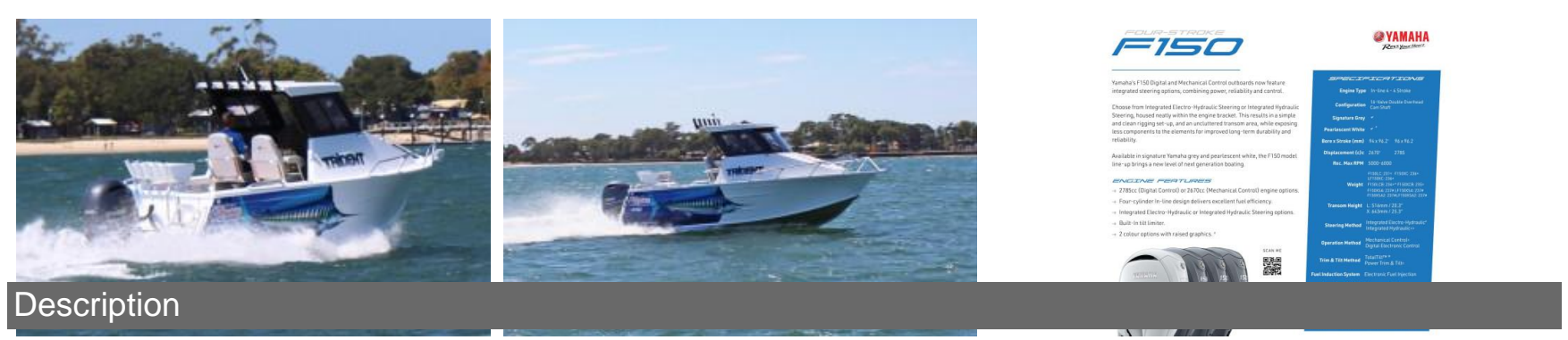
Quintrex 610 Trident Hard Top

The Quintrex 610 Trident Hard Top has versatility on the water, designed with a keen eye for both aesthetics and functionality, this model features a striking white hull, accentuated with a tasteful decal and stripe, perfectly complementing its robust build. The 610 Trident is more than just a pretty face; it's a vessel built for the challenges of the ocean. Its hard top design offers protection and comfort, allowing you to tackle the seas regardless of the weather.