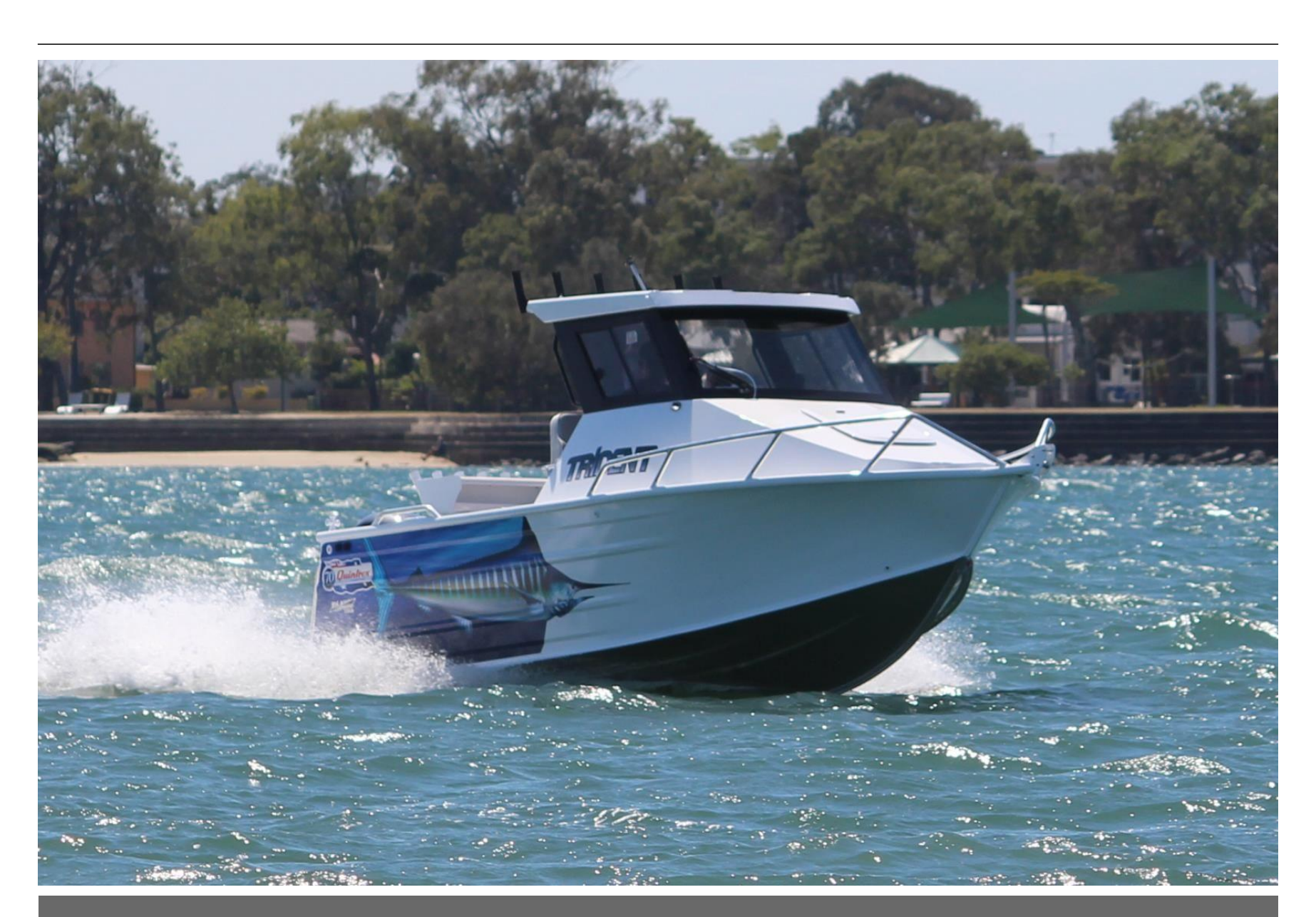
Quintrex 610 Trident Hard Top + Yamaha F150hp 4-Stroke - Pack 3 for sale online prices $119,990

Email: online@brisbaneyamaha.com.au Website: www.brisbaneboatsforsale.com.au