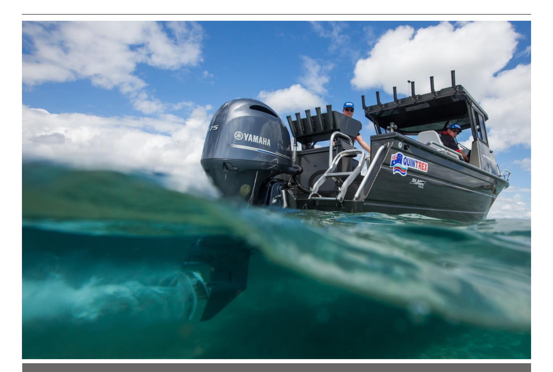
Quintrex 650 Trident Hard Top + Yamaha F150hp 4-Stroke - Pack 2 for sale online prices $116,990