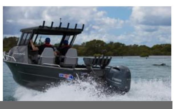
The Quintrex 650 Trident Hard Top stands as a paragon of robust maritime engineering, artfully crafted to meet the rigorous demands of the discerning ocean adventurer. Painted in a pristine white, complemented by striking decals and stripes, this vessel not only promises a commanding presence on the waters but also assures durability and resilience in the face of the ocean's unpredictability. The hard top design, a hallmark of the Trident series, offers both protection from the elements and a sense of security, making it an ideal choice for both leisurely cruises and serious offshore fishing excursions.

Equipped with a Yamaha F150HP 4-stroke engine, the 650 Trident Hard Top balances power with efficiency, ensuring smooth navigation through varied marine conditions. This prowess is further enhanced by the inclusion of the Quintrex Hydraulic-Braked Tandem Trailer 2600ATM, which guarantees ease of transport and reliability. The boat is kitted with essential and advanced features like the Garmin ECHOMAP UHD2 95SV Chartplotter/Sounder Combo, ensuring not just seamless navigation but also an enriched fishing experience. The G2 Display Mount adds to the convenience, providing clear, easy access to navigational data and fish finding sonar.