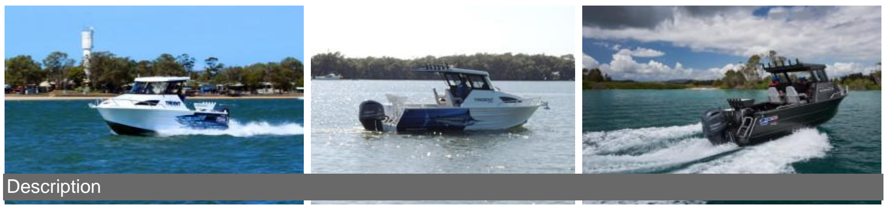
Quintrex 690 Trident Hard Top with Yamaha F225HP 4-Stroke and Garmin Echomap UHD2 125SV

Fully painted with striking two-tone sides and a distinctive decal/stripe, this vessel isn't just about looks; it's engineered to conquer the ocean. The hard top design offers protection from the elements, ensuring comfort during those long days at sea. Whether you're cutting through rough waters or cruising on calm seas, the 690 Trident with its Millennium Blade Hull design ensures a smooth, stable ride, and unrivaled performance.