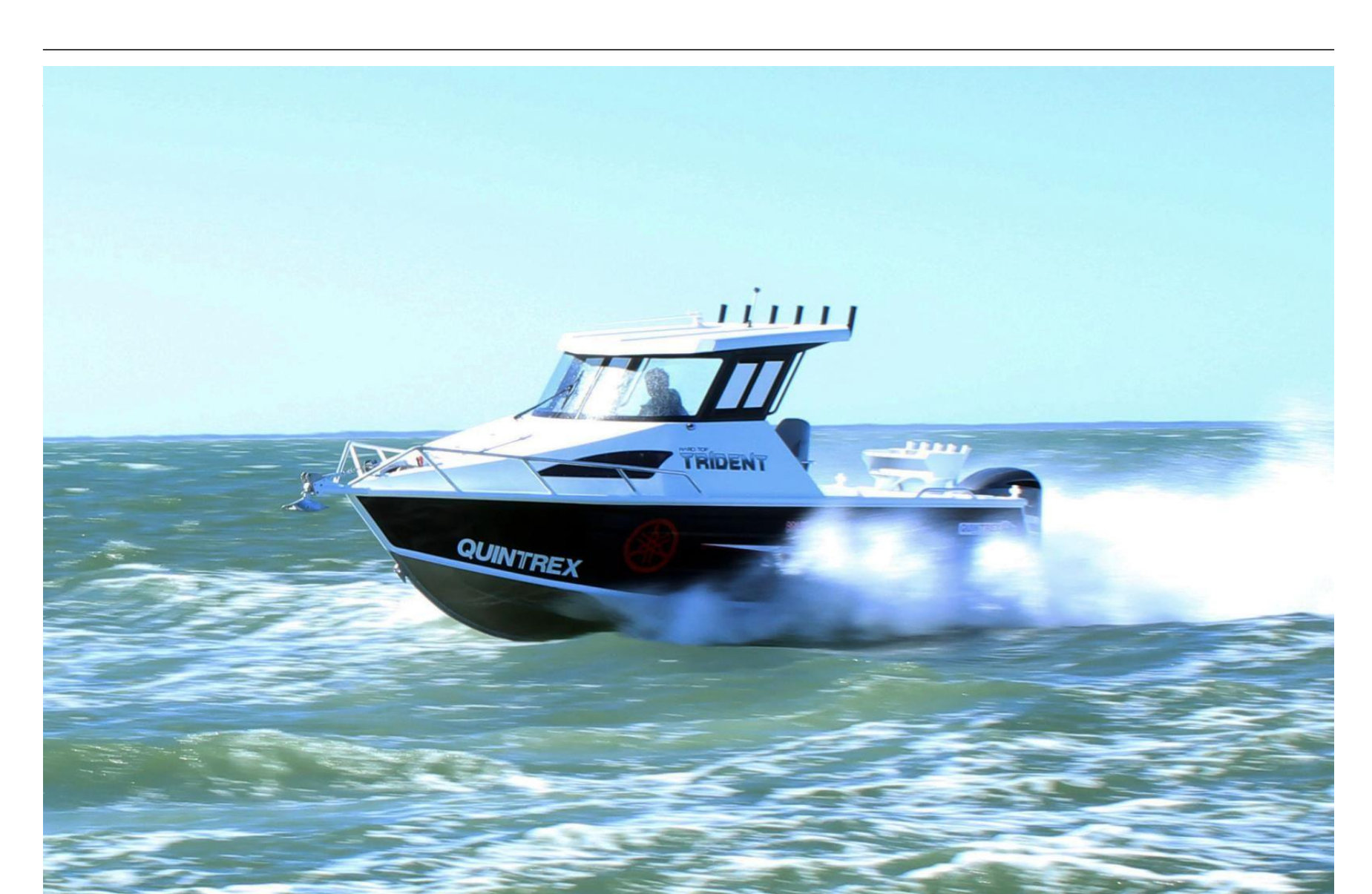
Quintrex 690 Trident Hard Top + Yamaha F225hp 4-Stroke - Pack 2 for sale online prices $132,990