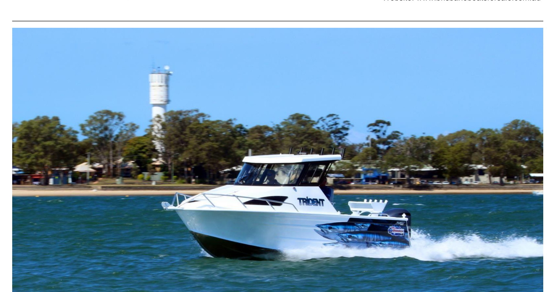
Quintrex 690 Trident Hard Top + Yamaha F250hp 4-Stroke - Pack 3 for sale online prices $140,390