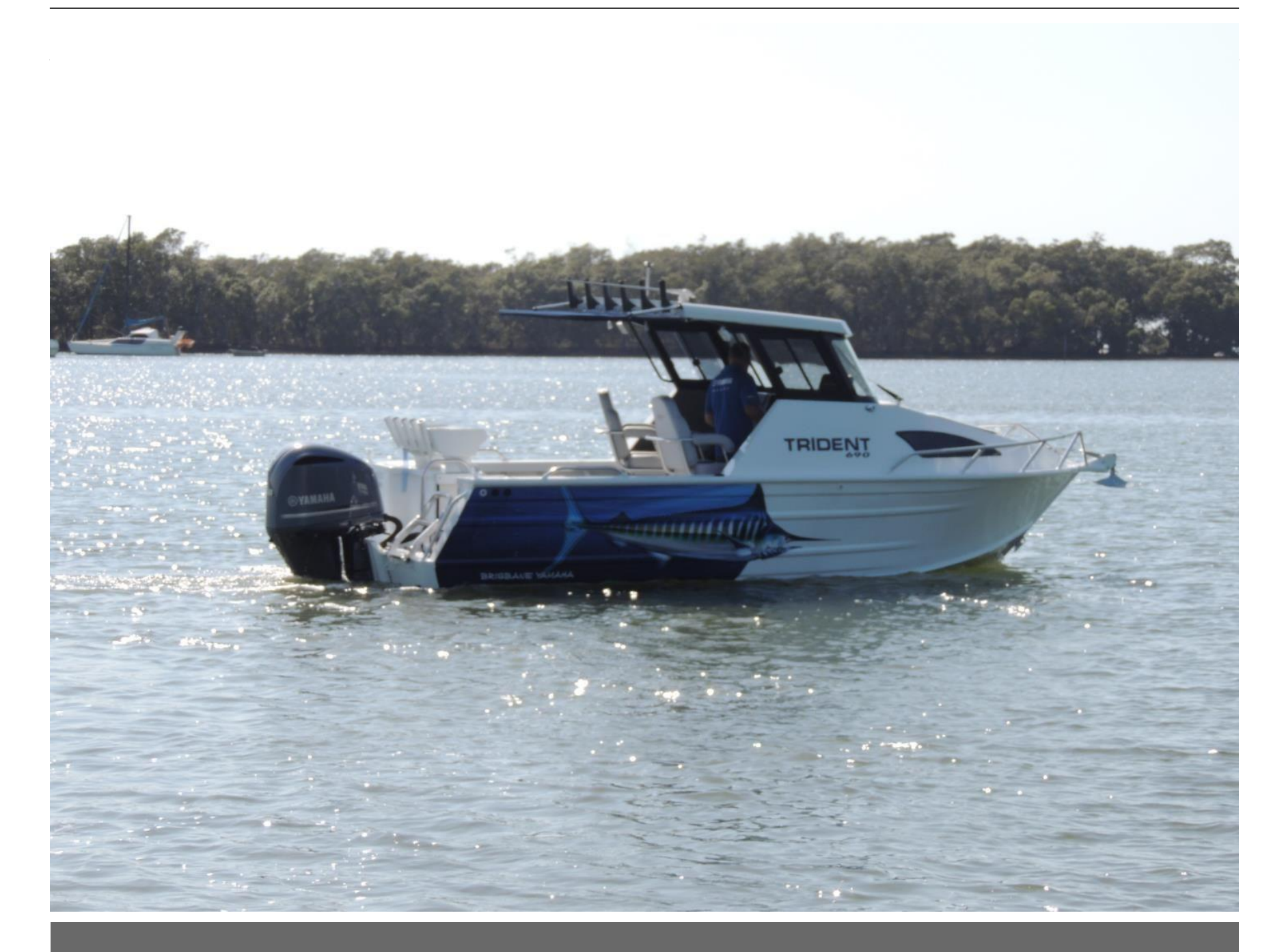
Quintrex 690 Trident Hard Top + Yamaha F250hp 4-Stroke - Pack 4 for sale online prices $152,890