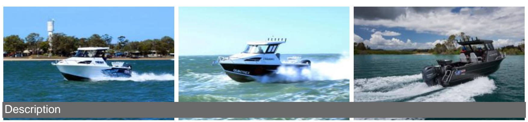
Quintrex 690 Trident Hard Top with Ultimate Pack 4: A Boating Enthusiast's Dream

Immerse yourself in the ultimate boating experience with the Quintrex 690 Trident Hard Top, a vessel that exemplifies strength, durability, and style. This model stands out with its fully painted exterior, featuring eye-catching 2-tone sides and a striking decal/stripe design, ensuring you make a statement on the water. Engineered for the serious angler and adventure seeker, the Trident is perfectly complemented by a robust Quintrex Hydraulic-Braked Tandem Trailer 2600ATM, designed for ease of transport and reliability.