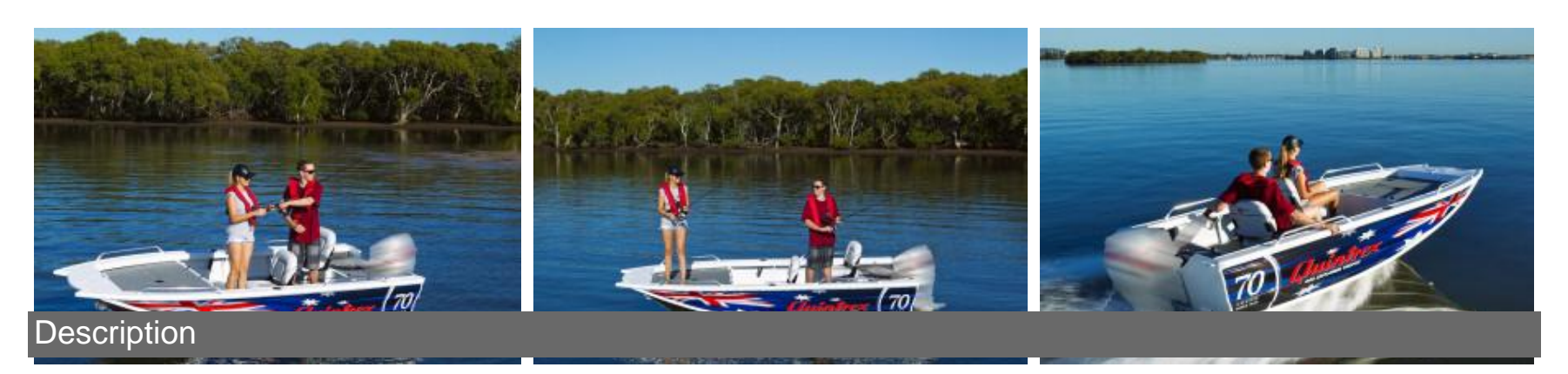
The Quintrex F400 Explorer Trophy L/S is an exceptional choice for anglers and outdoor enthusiasts seeking a compact yet capable vessel. This model stands out in its class, offering a unique combination of durability, stability, and versatility.

Crafted for the adventurer, the F400 Explorer Trophy features a robust design with a length of 4.0 meters, ensuring easy maneuverability in various water conditions. Its fighter series bow design contributes to its stability, making it an ideal choice for both tranquil inland waters and more challenging environments. The boat's construction emphasizes durability, with a bottom and top sides made of high-quality aluminum, ensuring longevity and resistance to the typical wear and tear of frequent use.