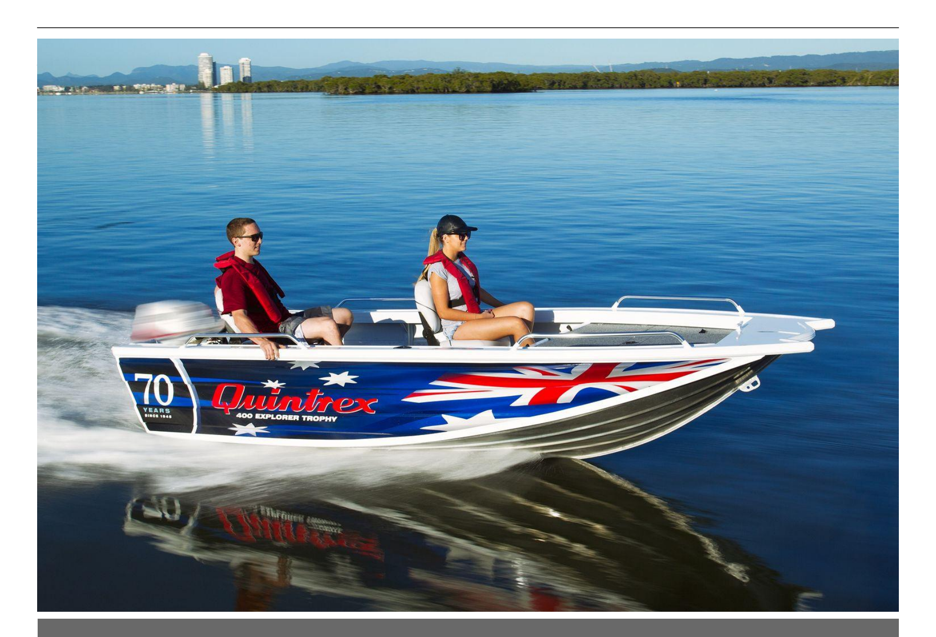
Quintrex F400 Explorer Trophy + Yamaha F40LA 4-Stroke - Pack 1 for sale online prices $23,590